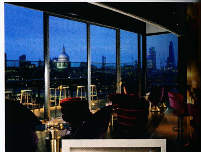
FROM TOP: Perfect views over London; nautical-themed sculptures in the Mondrian's lobby and bar

Back on ground level, the cocktail bar Dandelyan and restaurant Sea Containers make the most of the Thames Path, with huge windows to spy on passers by. It's addictive. Get in before the fashion crowd bagsies the best seats. SASKA GRAVILLE From £195 plus VAT; mondrianlondon.com