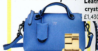
Leather and crystal bag, £1,430, Fendi