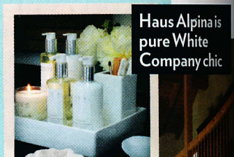
Haus Alpina is pure White Company chic

Book a Red-approved getaway at REDONLINE.CO.UK