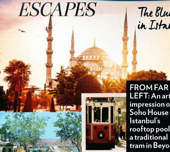
FROM FAR LEFT: An artist's impression of Soho House Istanbul's rooftop pool; a traditional tram in Beyoğlu