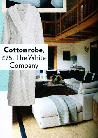
Cotton robe, £75, The White Company