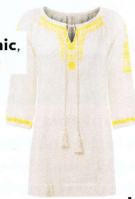
Cotton tunic, £75, East

The global rise and rise of Soho House continues this month, with the opening of Soho House Istanbul. Sure to become the city's hippest new check-in, the hotel, in Beyoğlu district, boasts 87 bedrooms, a Cecconi's restaurant, Cowshed spa and the group's first nightclub. We suspect the highlights will be the rooftop bar and two swimming pools. The sights of Istanbul need no introduction – Hagia Sophia, the Blue Mosque, the Grand Bazaar, there's a lot to see – but even if you stick close to home in Beyoğlu's many bars and restaurants, we reckon a perfect minibreak is guaranteed. sohohouseistanbul.com